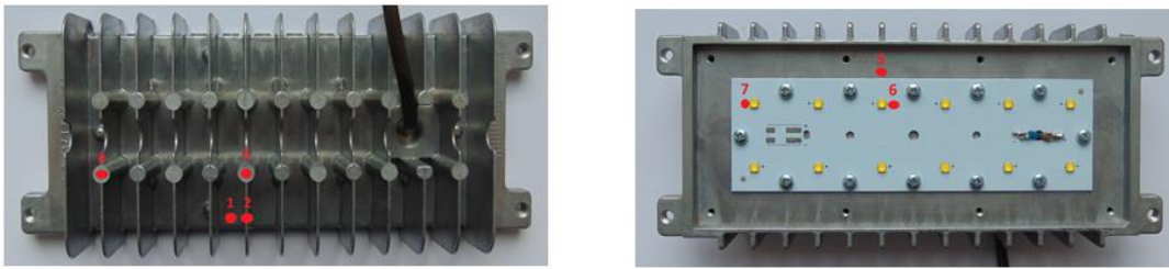
FIGURE 2. Arrangement of temperature measurement points on the tested LED module

Thermal analysis was performed for three forward currents: 350 mA, 700 mA and 1050 mA. In order to determine the junction temperature, the previously determined thermal power for the three above currents and the real thermal resistance R_{thj-c} between the junction and the diode case were assumed for the simulation.